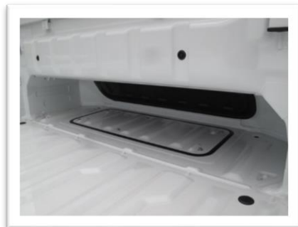
Tray cove above gives you extra room for dimensional lumber outside and room for important items-inside.