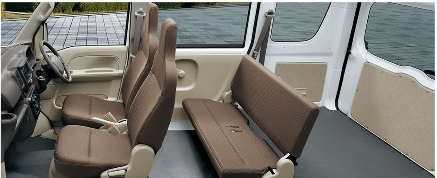
Shuttle Interior: Rear bench folds flat into floor.