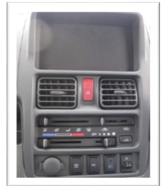
Double din radio slot and standard instrument controls. Push button 4WD.