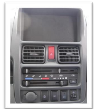
Double din radio slot and standard instrument controls. Push button 4WD.