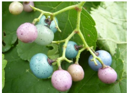
Bryn Scriver, Lakeshore Nature Preserve

BIOLOGY & SPREAD: Porcelain-berry spreads by seed and through vegetative means. The colorful fruits, each with two to four seeds, attract birds and other small animals that eat the berries and disperse the seeds in their droppings. The seeds of porcelain-berry germinate readily to start new infestations. Porcelain-berry is often found growing in riparian areas downstream from established patches, suggesting they may also be dispersed by water. The taproot of porcelain-berry is large and vigorous.