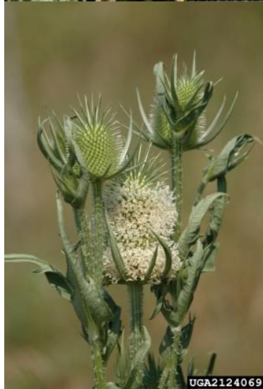
Chris Evans, Illinois Wildlife Action Plan, Bugwood.org

joining into cup around the stem. Leaves of cut-leaved teasel are broader and have deep, feathery lobes. Common teasel's leaves are not lobed. Both species have hundreds of small flowers, clustered in dense, egg-shaped