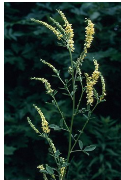
Yellow sweet clover