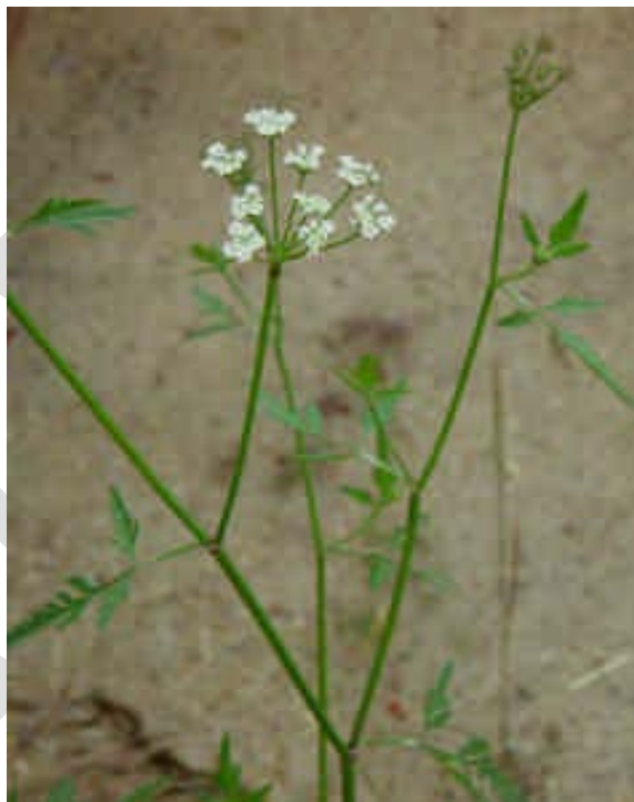
Japanese hedge parsley

SIMILAR SPECIES: Queen Anne's lace or wild carrot ( Daucus carota )—a widespread weed in Wisconsin—has similar finely-divided leaves, but leaves and stems are quite hairy and when crushed smell like carrots. Other look-alikes include wild chervil ( Anthriscus sylvestris ), caraway ( Carum carvi ), poison hemlock ( Conium maculatum ), Chinese hemlock parsley ( Conioselinum chinense ), sweet cicely ( Osmorhiza spp.) and spreading hedge parsley. Spreading hedge-parsley ( Torilis arvensis ) is not currently known in Wisconsin, but nationally is more common than T. japonica . It looks very similar to Japanese hedge parsley but lacks the pointed bracts at the base of each umbel.