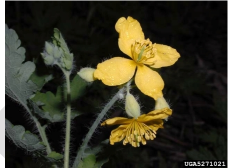
Leslie J. Mehrhoff, University of Connecticut, Bugwood.org

DESCRIPTION: Greater celandine is an herbaceous biennial, sometimes perennial, that grows up to 2 feet tall with a semi-woody tap-root. It has sprawling branches and ribbed stems covered with soft hairs. When broken, it reveals an orange-yellow sap. Leaves are alternate, compound and deeply lobed, with rounded teeth. The leaves are up to 6 inches long and 3 inches wide, with 5 leaflets or lobes that are ovate. Leaves are slightly hairy, green above and pale green below, and have fine hairs along the leaf veins. When stems are broken, toxic orange-yellow sap exudes. The yellow flowers have 4 petals in axillary umbels of 3-8 flowers. Flowers bloom from April-September.