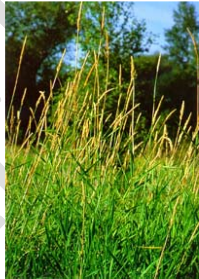
Reed Canary Grass

Reed canary grass also resembles non-native orchard grass ( Dactylis glomerata ), but can be distinguished by its wider blades, narrower, more pointed inflorescence, and the lack of hairs on glumes and lemmas (the spikelet scales). Additionally, bluejoint grass ( Calamagrostis canadensis ) may be mistaken for reed canary in areas where orchard grass is rare, especially in the spring. The highly transparent ligule on reed canary grass is helpful in distinguishing it from the others. Ensure positive identification before attempting control.