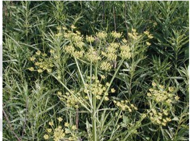
Wild parsnip

Wild parsnip can be confused with prairie parsley ( Polytaenia nuttallii ), a native prairie species listed as threatened in Wisconsin. Its flowers and leaves resemble those of wild parsnip. Comparatively, flowers of the prairie parsley plant are light-yellow, sparse, and typically found at the end of the stem. The leaves are pinnately compound like those of the wild parsnip, but are oblong with few teeth.