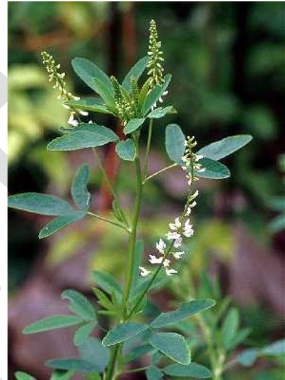
White sweet clover

Both white and yellow sweet clovers are biennials. After germination in late spring or summer, the plants put their energy into developing a healthy root system. First-year plants can be found in late summer. In the second year, plants may be seen in late April or early May. By that