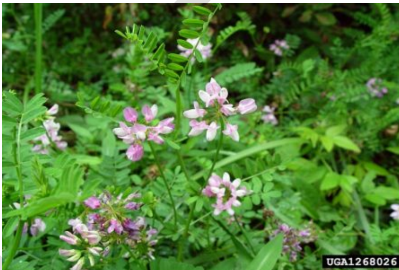
Chris Evans, Illinois Wildlife Action Plan, Bugwood.org

DESCRIPTION: Crown vetch is an herbaceous perennial in the legume family. This species has creeping stems that form dense colonies, growing 2-6 feet long. In winter and early spring, crown vetch can be easily recognized as large, brown patches. Leaves are pinnately compound, alternate and 2-6 inches long, with 11-25 elliptical leaflets occurring in an odd number. Leaves are hairless. The flowers are pea-like, ranging in color from pink or lavender to white. Flowers are clustered in flat-topped umbels of 14-20 flowers that grow on long stalks extending from the leaf axils. Blooms form from mid-spring through August. Long, slender, pointed seed pods contain 3-7 narrow seeds each develop in late summer. Seeds remain viable in the soil for up to 15 years. Crown vetch also reproduces vegetatively by fleshy rhizomes that grow up to 10 inches long. Roots are not fibrous, limiting the utility of crown vetch for erosion control.